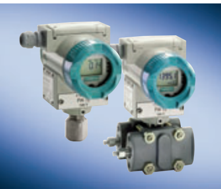
The DS III series

The SITRANS P DS III transmitter features a special safety standard for pressure, differential pressure, absolute pressure and fill level. The transmitter is suitable for use in SIL 2 measurement loops according to IEC 61508/IEC 61511. Safety-related functions include automatic error diagnostics, defined error handling as well as calculation of the error rate.