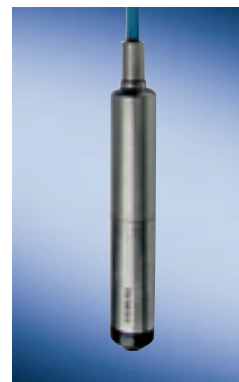
The MPS series

The SITRANS P, MPS series is a transmitter for hydrostatic level measurement. It's dipped into the medium hanging at the end of a cable. The sensor's stainless steel housing makes it suitable for use in everything from drinking water to aggressive liquids.