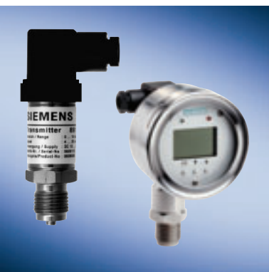
The Z and ZD series

In the Z series, we use two types of diaphragm materials: stainless steel or ceramic. That makes measuring process pressure, absolute pressure and hydrostatic pressure a breeze. You can set the pressure measured with these sensors to be transformed into either a 4–20 mA or 0–10 V signal.