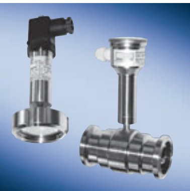
The Compact series

The SITRANS P Compact is an analog transmitter for measuring absolute and gage pressure. It was developed with the special requirements of the food-and-beverage/pharmaceuticals/biotechnology industries in mind. The devices are designed to meet the hygienic recommendations of EHEDG, FDA and GMP. A number of aseptic process connections made of stainless steel and a stainless steel housing (IP67) were included in the Compact series to meet the more stringent hygienic requirements. High surface quality was a special focus, with an option to electropolish the system. Our pressure measurement specialist "Compact" complements its cleaning and sterilization process (CIP, SIP) with no-drift, error-free functionality.