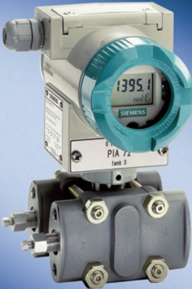
The DS III series