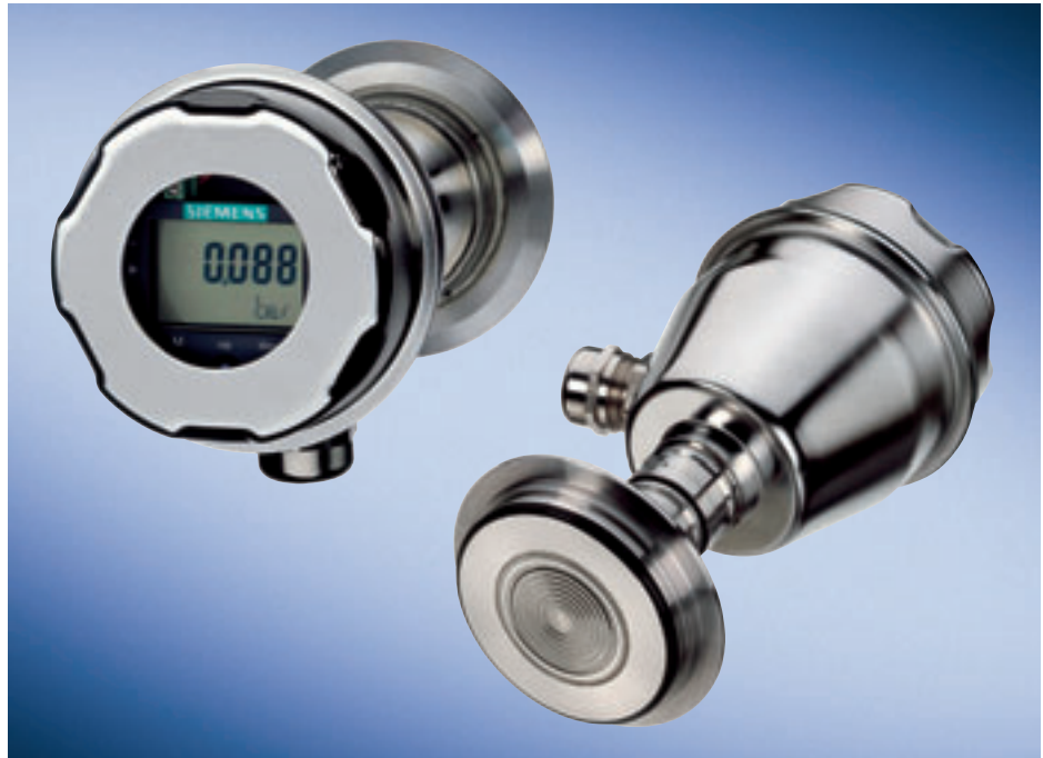
The P300 series

It is also worth mentioning the optional extended temperature range up to 250 °C/ 482 °F, which allows the transmitters to be used in applications for which remote seals had to be used in the past. This is where the SITRANS P300 stands out thanks to its increased accuracy of measurement and shorter delivery times as compared to remote seals.